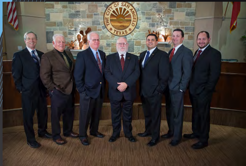
2015 COSADC Board Members