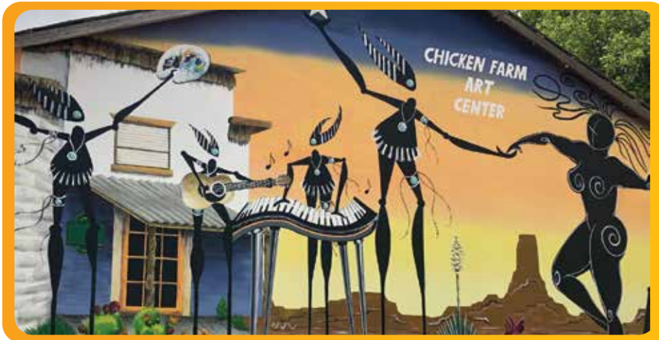
Chicken Farm Art Center