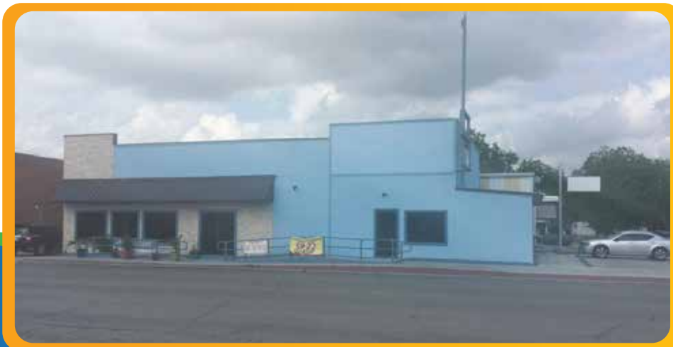
San Angelo Insurance