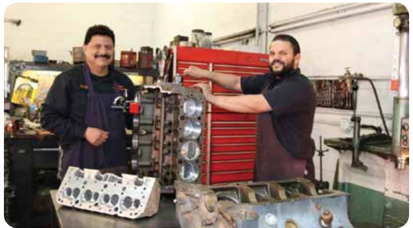
Engine Pro Machine

Economic Development staff met with 10 companies to explain the BREP program and discuss the future growth plans of the companies. These meetings culminated in the preparation of 4 Economic Development Agreements with incentives ranging from $5,000 to $1.5 million.