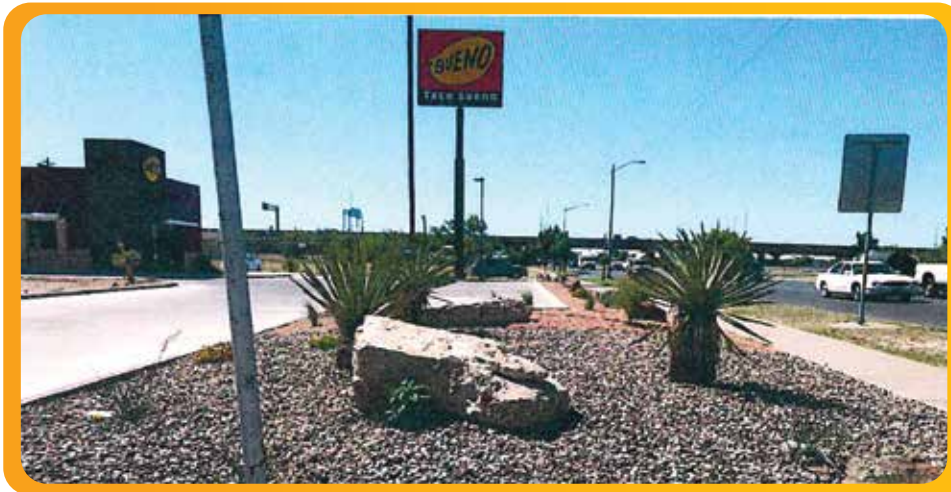
Taco Bueno/Kilcon Properties