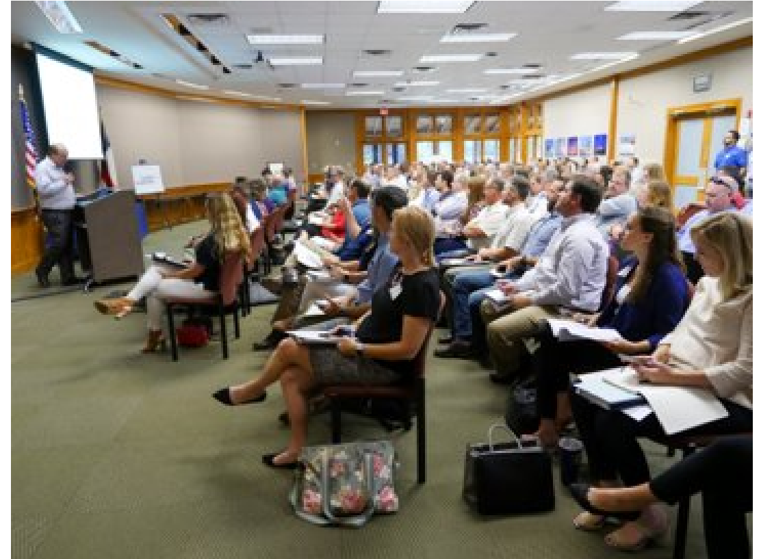
TWDB flood outreach meeting in Bastrop, TX.