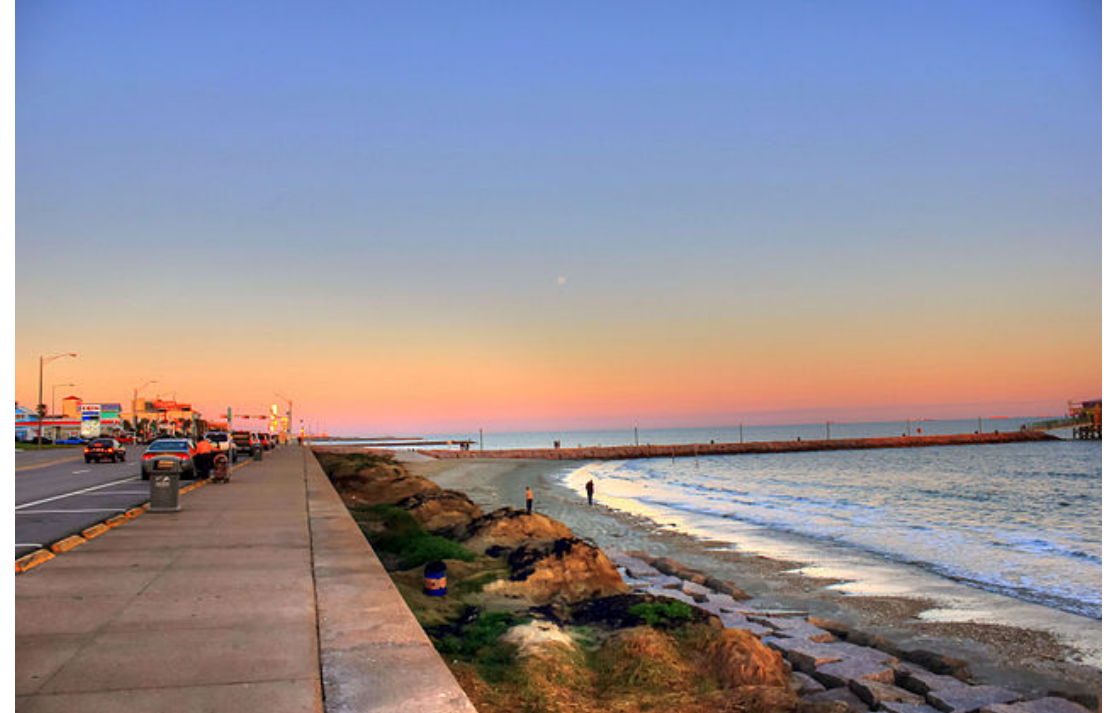
Galveston Seawall, a structural flood mitigation solution.