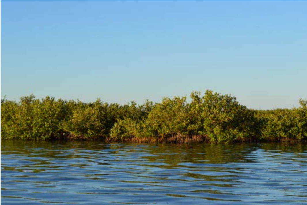
Mangroves on the Texas Coast stabilize shorelines and help absorb storm surge; an example of a non-structural flood mitigation solution.

The implementation of actions, including both structural and non-structural solutions , to reduce flood risk to protect against the loss of life and property.